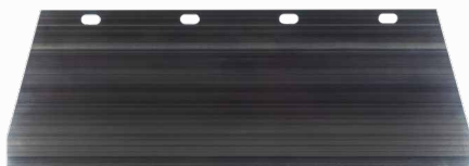
21000Q REPLACEMENT BLADES (Sold Separately)