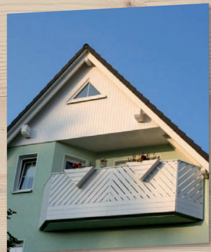
Balcony and facade panellings