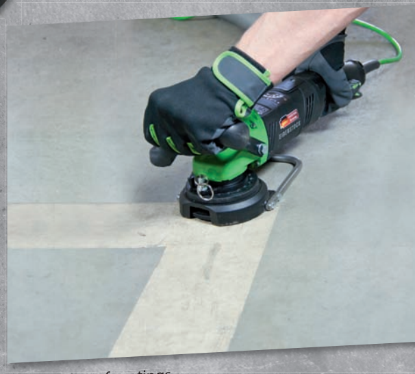
Removing of coatings (e.g. markings, floor sealing, oil protection paint)