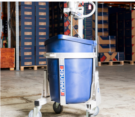
1. Mixing Station MS100