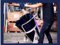
5. Easy tilt operation for precision pouring