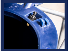
6. Hose Connector