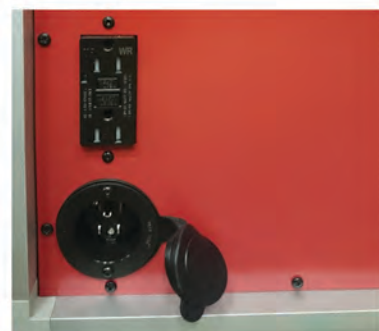
Daisy Chaining Feature

Pre-Filter (20Pack) 201000014 HEPA Filter 200700532A Transportation Cover 201000112 Hose Adaptor 201000438