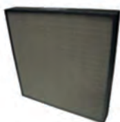
HEPA Filter 10085