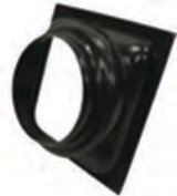
Hose Adaptor 201000437