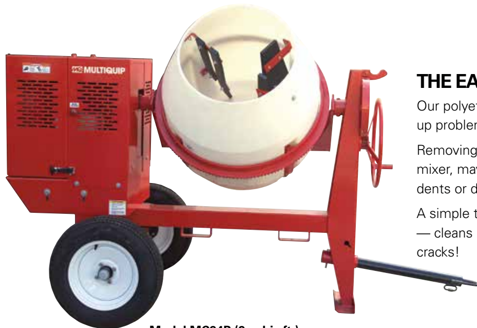
Model MC94P (9 cubic ft.)

The MC12PH concrete mixer handles your biggest and toughest applications. It features a 12 cubic ft. Easyclean™ drum and powerful Honda GX340 engine.