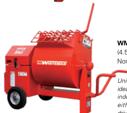
WM45 (4.5 cubic ft., Steel drum) Non-towable

Unique wheelbarrow design ideal for small batch jobs and indoor work. Available with either electric or gasoline drive.