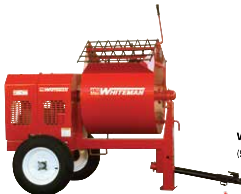
WM90S (9 cubic ft., Steel drum)