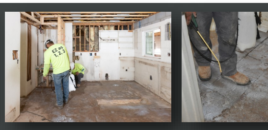
Prime all substrates with Maxxon Fortify Primer per instructions found on Maxxon Fortify TDS.

*If it is determined the subfloor is not fully dry, contact Maxxon Corporation for required next steps.