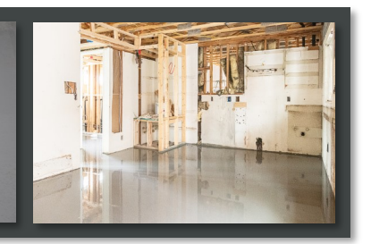
Gyp-Crete EZ can be walked on in as little as 4 Refer to TDS for Floor hours. Covering installation.