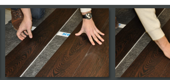
3. Engineered/Laminate wood floors, LVT/LVP are applied directly to Acousti-Top. Take care to avoid placing flooring seams directly in line with Acousti-Top seams.

*The installation of Acousti-Top does not eliminate the need for expansion or movement joints, including perimeter joints. An expansion of 1/4* must be maintained at all times. Use Maxxon Perimeter Isolation Strips to assist in maintaining the expansion gap.