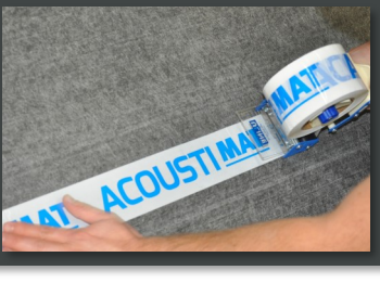
Tape seams of Acousti-Top with minimum 2" width tape.