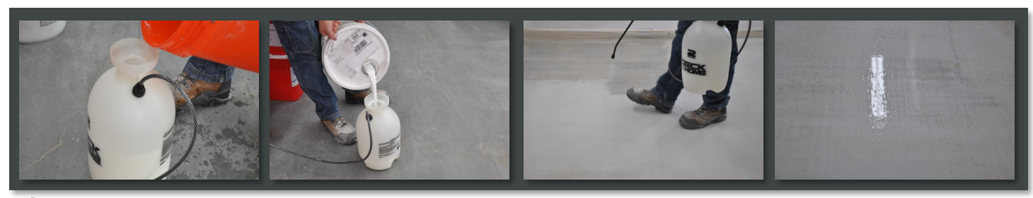
Mix 1:1 (1 part clean, potable water to 1 part Fortify Primer Concentrate).