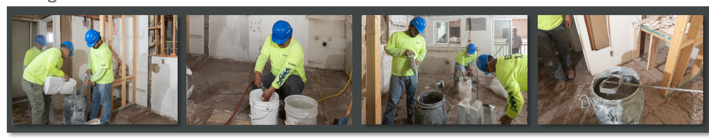
1. In a 15 gallon mixing barrel, mix 4.5 qts of water per 50 lb bag of Level EZ. In this size container, a typical mix consists of two bags of Level EZ with the correct amount of water per bag.