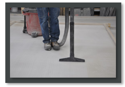
concrete should be broom cleaned, contaminant free and should have a smooth finish, free from voids and sharp protrusions.