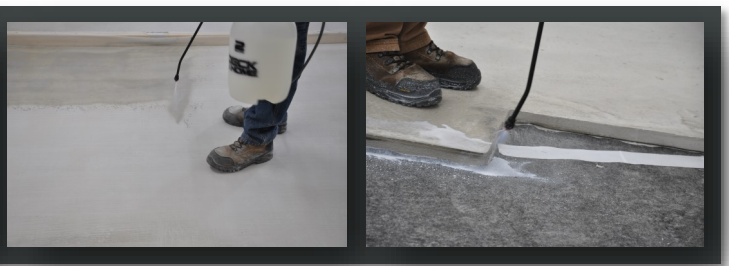
Prime all substrates, including exposed edge and surface of existing underlayment, with Maxxon Fortify Primer or Maxxon Multi-Use Acrylic per instructions found on corresponding TDS.

*A sound mat, such as Maxxon's Acousti-Mat or Acousti-Top®, can be installed directly on the subfloor and encased in the Gyp-Crete EZ to ensure a similar acoustical performance throughout the floor. **If it is determined the subfloor is not fully dry, contact Maxxon Corporation for required next steps.