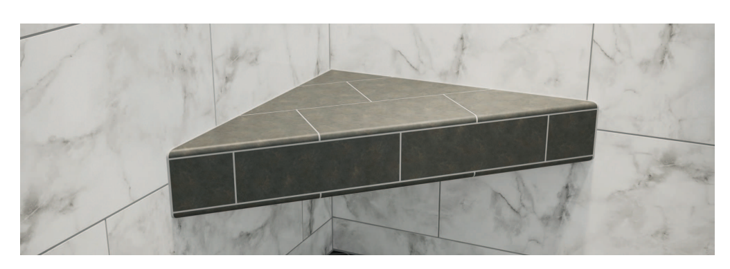
7. Apply thin-set and your choice of finished product.