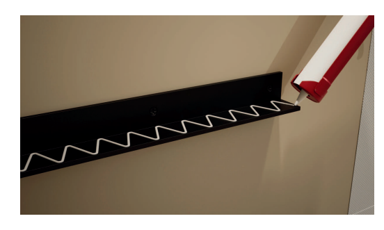
3 Apply adhesive to the brackets, and then set the bottom board onto the brackets.