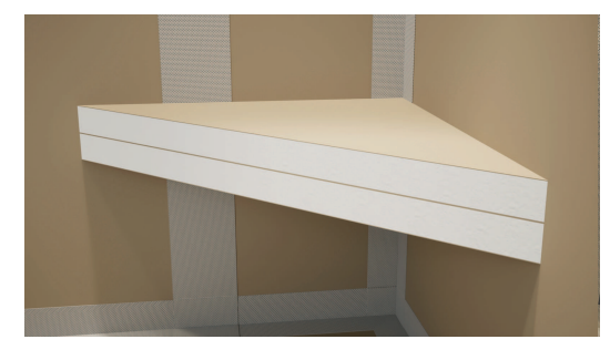
5. Attach the top board to the bottom board.