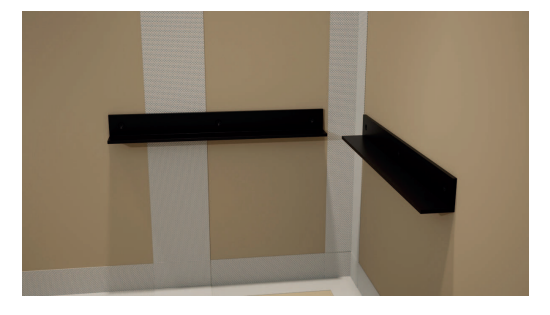
2. Install brackets at the desired height using the provided hardware. Ensure they are level and securely attached.