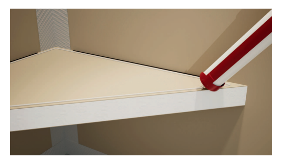
4. Apply adhesive to the bottom board.