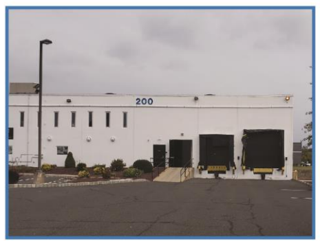
Bartell Morrison (USA) LLC

200 Commerce Drive, Unit A Freehold, New Jersey, USA 07728