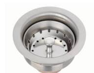
Sink Strainer Optional