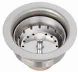
Sink Strainer Optional