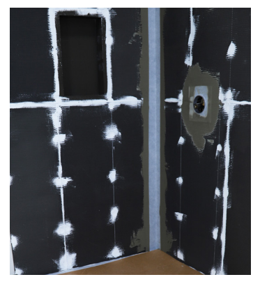
Method 2 (ARDEX CA 20 P™)