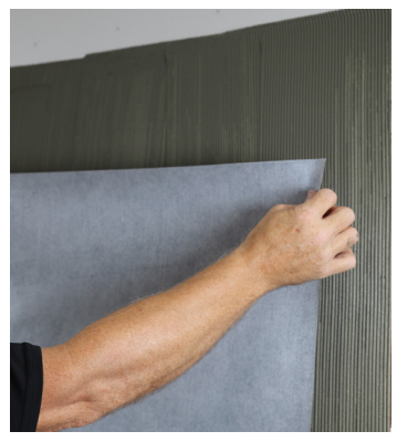
Method 3 (ARDEX TLT™ Waterproofing Membrane)