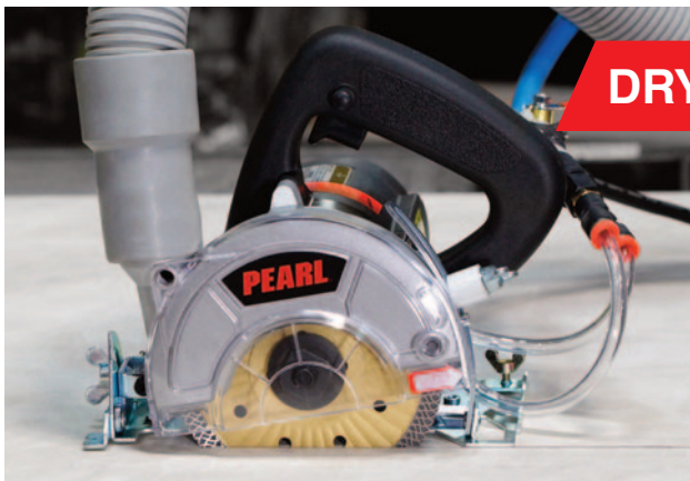
Vacuum port and blade guard cover for dust control