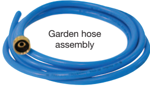
Garden hose assembly

Side handle, T-socket wrench, Rip guide, Dust guard cover, Garden hose assembly, Blade guard hose assembly and Owner's manual.