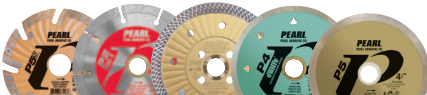
PEARL PROFESSIONAL BLADES