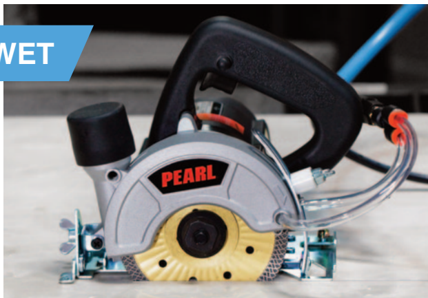
Water hose system with control valve