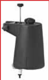
2-Gallon Tank (Available in 3 Different Colors)