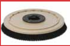
Nylon or Poly Brush