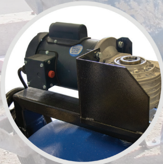
1/2 HP electric motor