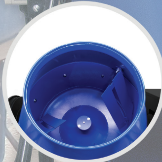
Two-piece replaceable blade system