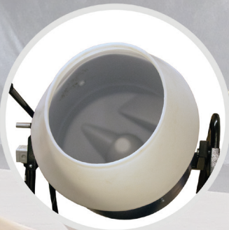
FDA/NSF/USDA approved non-stick polyethylene drum