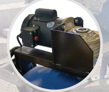
1/2 HP electric motor