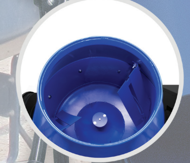
Two-piece replaceable blade system