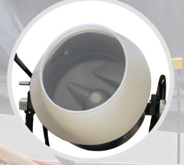
FDA/NSF/USDA approved nonstick polyethylene drum