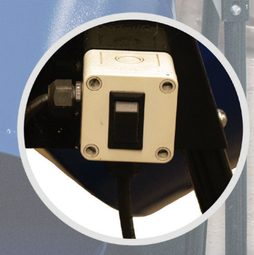
ON / OFF switch standard with electric motor