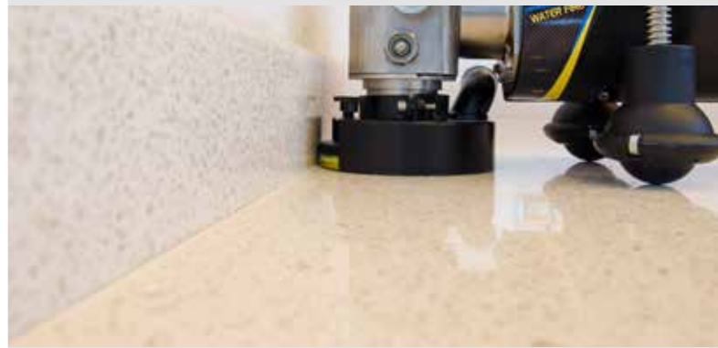
Grinding and polishing perimeters and edges