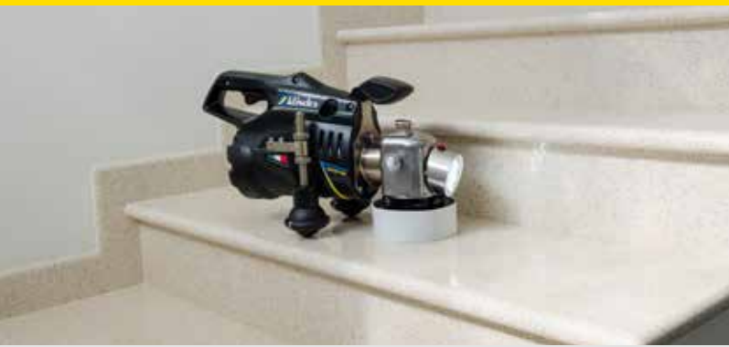
Grinding and polishing stairs