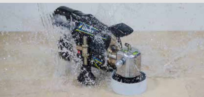
Maximum protection against water and dust