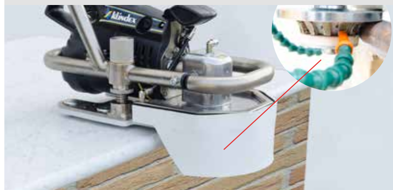
Edging Kit (art. 45041)