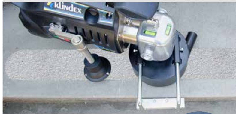
Bush-hammer Kit (art. UT21602)