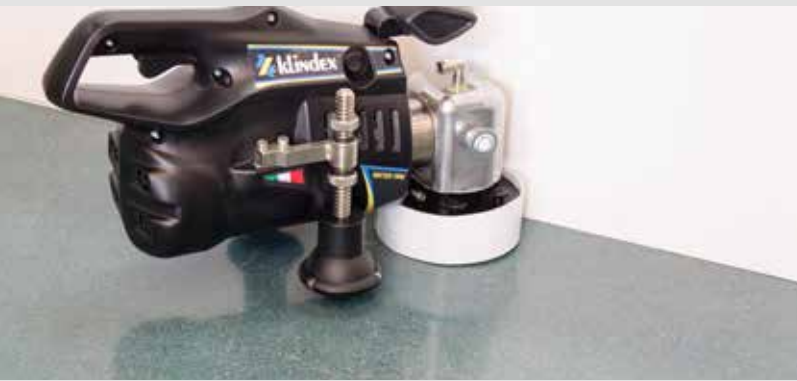
Grinding and polishing concrete