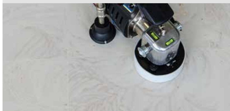
Wet and Dry grinding operation