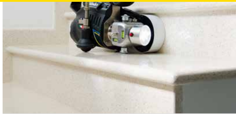
Grinding and polishing stairs skirting