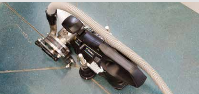
Open-joints Kit (art. 45040)