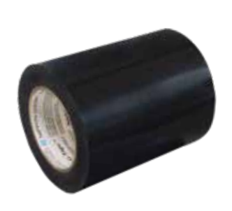
6" Black (BAB0650)