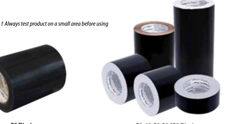
2", 4", 6", 9", 12" Black (3040BK) Permanent