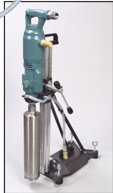
Rig-mounted Air Drill Only 52 lbs.

Drill & Anchor Stand – 2 1335 0010 SA (52 lbs.) Drill, Stand & Vacuum Pump – 2 1335 0010 SV (54 lbs.)