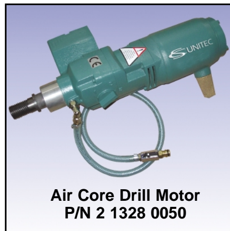
Air Core Drill Motor P/N 2 1328 0050